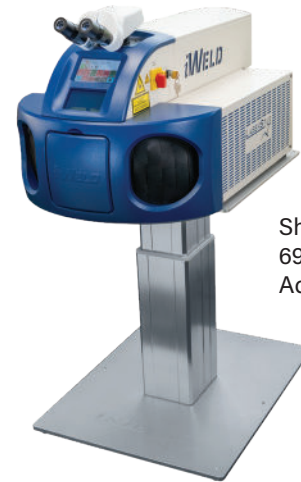
Shown with optional 693-100 Aluminum Adjustable Floor Stand

The system's compact, portable, space-saving design, coupled with LaserStar's well-known reputation for high quality, efficient laser sources, make the iWeld Benchtop Laser Welder an excellent value.